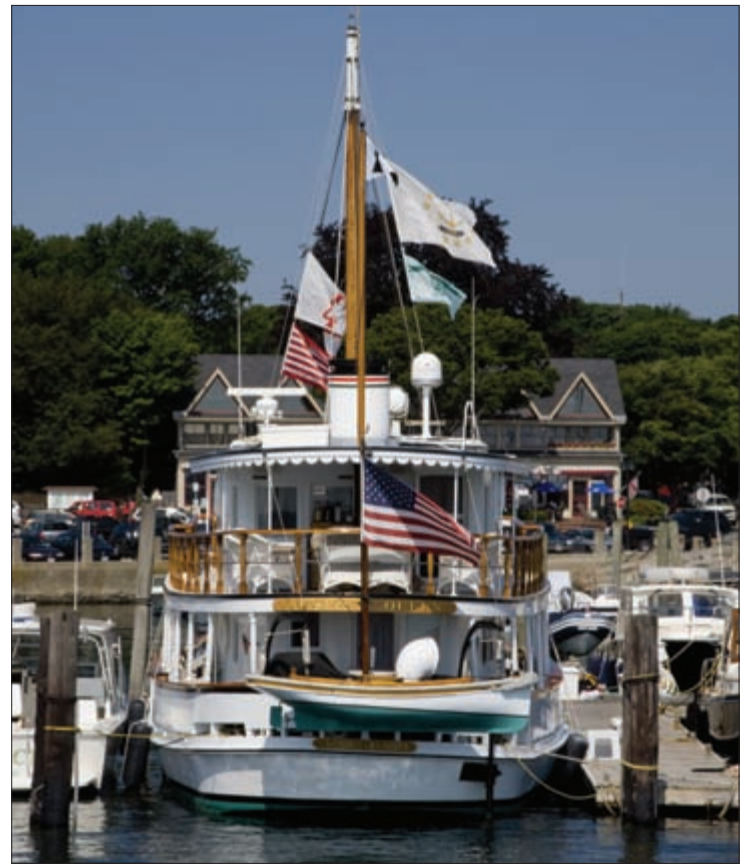
The Coastal Queen in her summer berth.

The museum is open on weekdays, with free of admission, from 7 a.m. until 3 p.m. ▲