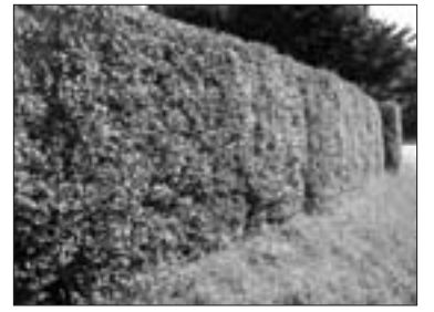
This is what a properly pruned hedge should look like