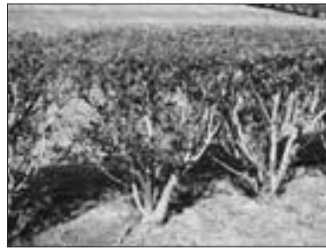
An example of a hedge not properly trimmed.

Similarly, fruit trees can be left until after the leaves have dropped off, although I like to prune out water shoots all summer. After leaves have dropped and the tree has gone dormant, cut out water shoots. These are the straight shoots that grow up the middle of the tree. Prune away any crossing branches that may rub together. Where the branches