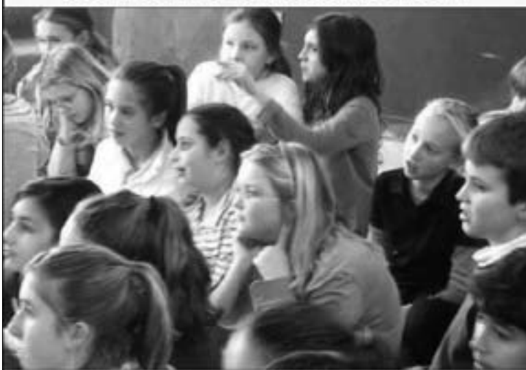
These fifth-graders are watching an eighth-grade demonstration of Newton's third law of physics

Before you educate your child, you need to educate yourself.