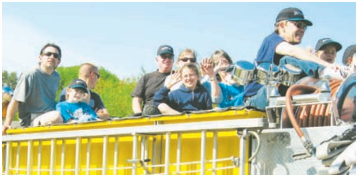
Riding in style . . . Some lucky kids and their parents rode the fire truck to the ball fields on the baseball season’s opening day last Saturday.

He concluded, “As a former resident of Jamestown I no longer have an interest in how the town evaluates this sorry episode but in my opinion the present council owes it to the taxpayers to call for a serious investigation to determine why huge legal bills were generated rather than settling a minor claim, who did what and why, and who benefited politically and financially. And when the investigation is completed, the results should be made public.”