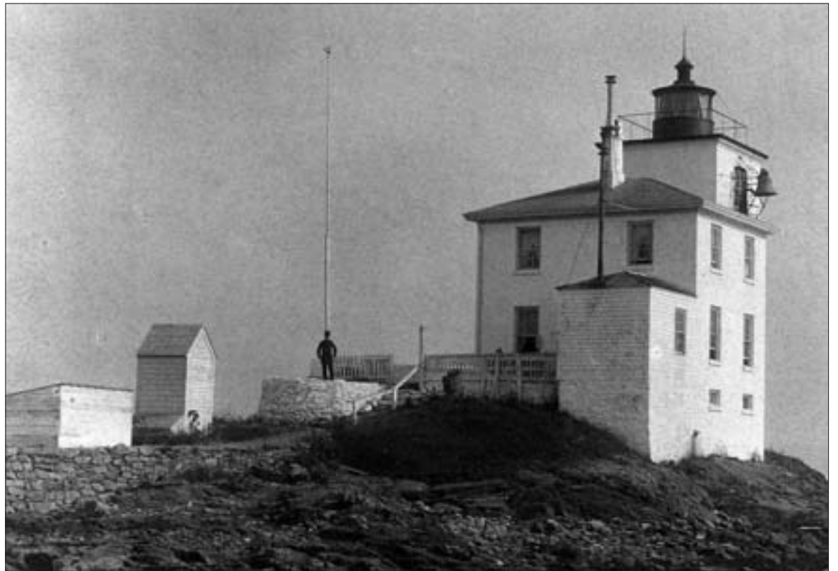
A late 19th-century photo of Dutch Island Lighthouse and the caretaker's residence.

Each project was completed in accordance with guidelines for historically significant buildings set by local, state, and federal agencies. Many have been recognized with awards for their historic accuracy and creativity, and have reaped the benefits of the Historic Tax Credit Program as well.