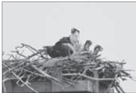
An osprey and chick in the nest at Great Creek.

Once in South America, Comet winged his way to the Choco region west of the Andes and joined the flyway taken by many ospreys from the Midwest. By mid-October he had settled down in the Cordillera Occidental, on the western slope of the Andes. Although far from the sea, this is one of the wettest corners of the planet, receiving