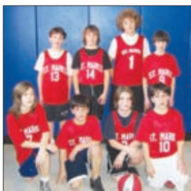
St. Mark boy's fourth and fifth grade basketball team.