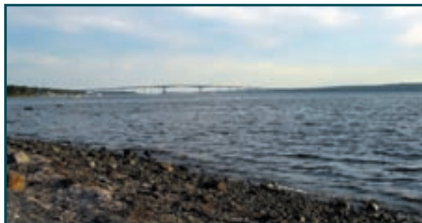
CHIC WATERVIEW CONDO $850,000