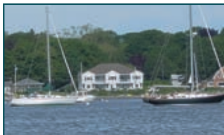
CHIC WATERVIEW CONDO $850,000