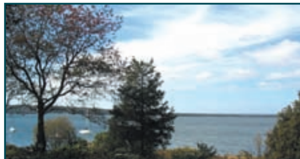
BEAVERTAIL BEAUTY $649,500