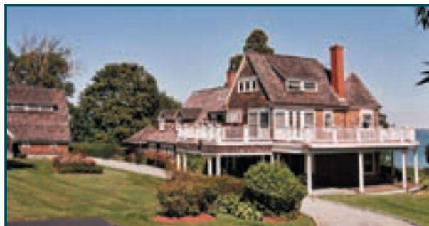
WEST PASSAGE WATERFRONT LOT $1,950,000