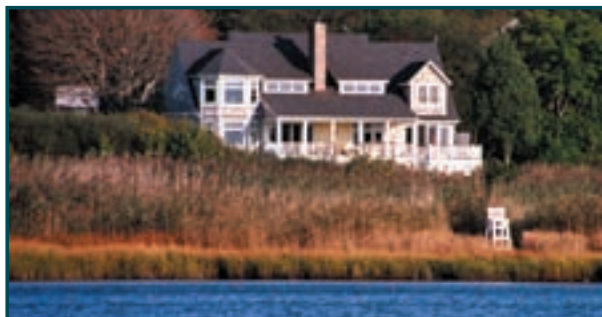
CONTEMPORARY VICTORIAN $995,000