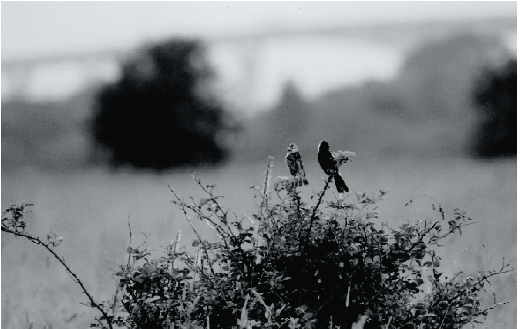
H A Y F I E L D with Female and Male Bobolink