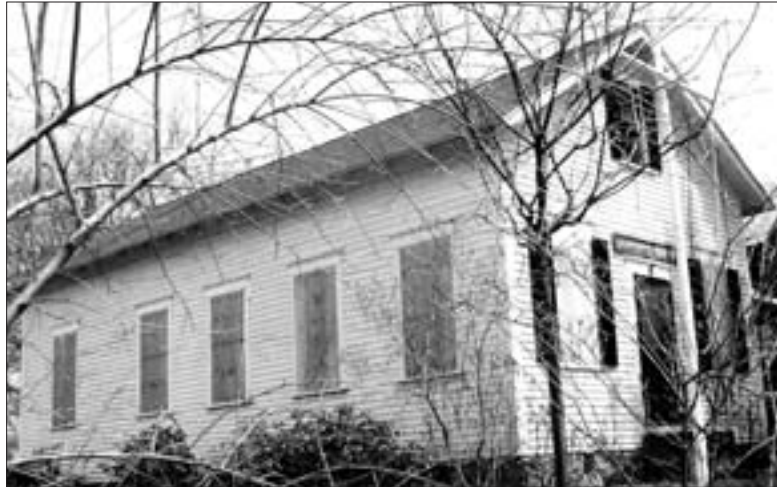
The Jamestown Museum is boarded up in preparation for a spring makeover.

museum; the ramp will lead to a new stone terrace across the right front of building. New steps from the street will have a gentler rise