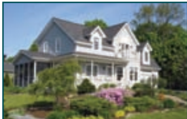
UNDER CONTRACT GLORIA KURZ, LISTING BROKER