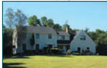
GREER BEECROFT LISTING AGENT