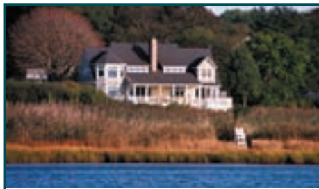
UNDER CONTRACT GLORIA KURZ, LISTING BROKER