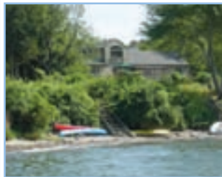
Waterfront Contemporary $2,195,000

Meticulously maintained 3 yr. new colonial with 3 bedrooms and 2.5 baths. Gas fireplace in large living room which opens to kitchen with granite counters and screened porch.