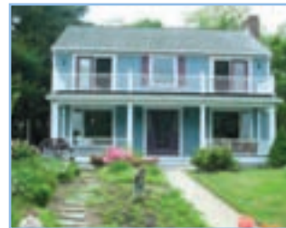
Waterviews to the Beach $725,000

28 West Passage Dr. Open Sunday 1-3 Spacious four bedroom, 3 bath home located at the end of a cul-de-sac on 1 private acre. Easily accessible waterfront to beach. Great home for relaxing on the water and boating. Dock permitting begun.