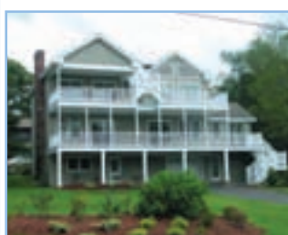
Great Waterviews! Newly Priced: $899,900

Totally renovated home with spectacular views of West Passage. Maple kitchen with granite counters. Magnificent master bedroom. Three full floors of wonderful living space.