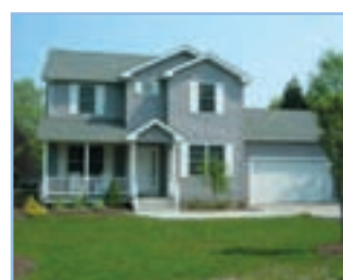
South Shores Colonial Newly Priced: $625,000

Totally renovated home with spectacular views of West Passage. Maple kitchen with granite counters. Magnificent master bedroom. Three full floors of wonderful living space.