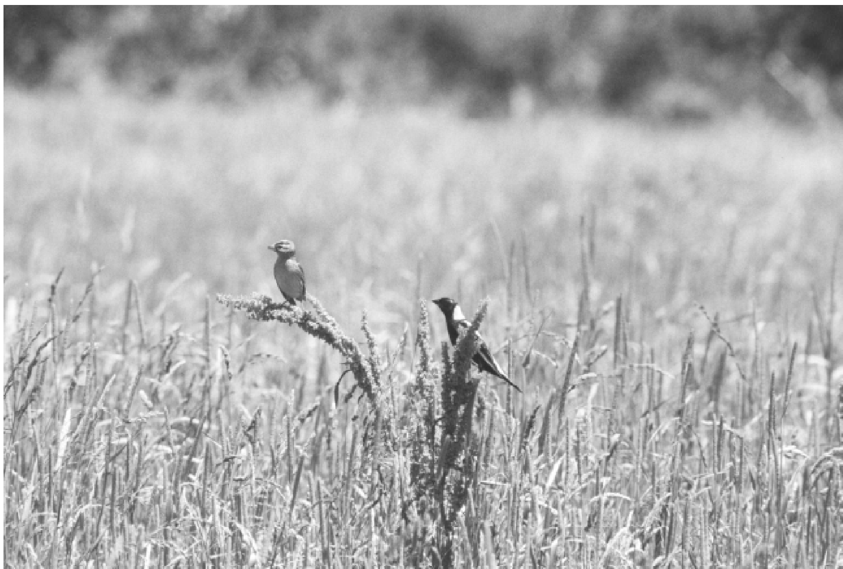
female & male bobolink