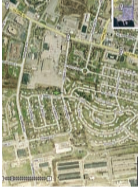
Middletown's former farms.

In a chilling front-page article in Sunday's Providence Journal (8/19/07), it was reported that New England is losing 167 acres of forest per day to development, and if present trends continue, Rhode Island could shortly lead the nation in the loss of forest. It is possible that by 2050 Rhode Island will be 70% urban. In our own backyard, we have an example of how complacency and a blind eye can transform a beautiful rural community of dairy farms and nurseries into a densely populated suburb. It took a mere 25 years for Middletown to undergo this irreversible transformation.