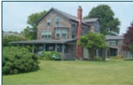
UNDER CONTRACT BUYER'S BROKER