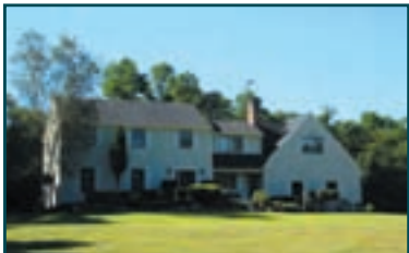
GREER BEECROFT LISTING AGENT