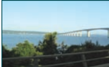
UNDER CONTRACT LISTING & BUYER'S BROKER