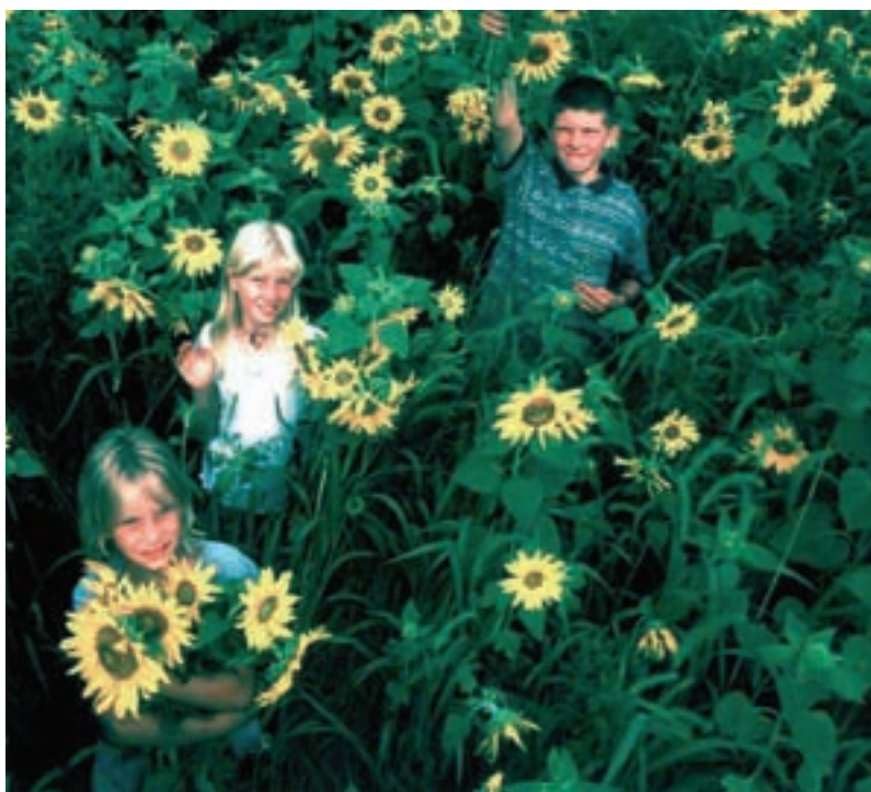
The Ceppi Farm, home to the Jamestown Community Farm, continues a 350-year tradition of farming. (left)