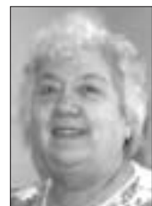
The Senior Times

Don't forget to come on down to the senior center for our seminar on 'Protecting Your Nest Egg' on Saturday, Sept.29, beginning at 1 p.m. There will a great deal of pertinent information on how to be prepared for your future. We'll be looking for you.