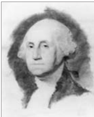
Gilbert Stuart's unfinished portrait of George Washington.

Members of the Jamestown Senior Center Watercolor Group thoroughly enjoyed their session on Sept. 20, as they took part in the filming of the "First Face," a production which will be aired nationally on PBS at some point