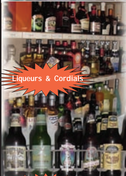
Liqueurs & Cordials