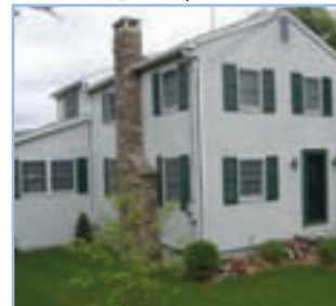
INTERIOR FEATURES GRANITE & WOOD DETAILS $588,000