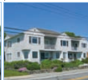
HARBORVIEW CONDOMINIUM $799,000