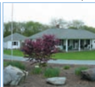
SPACIOUS ONE LEVEL LIVING $715,000