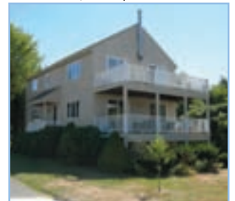
BEAVERTAIL WATER- VIEW CONTEMPORARY $640,000