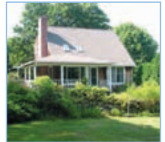
CHARMING HOME WITH STONE FIREPLACE $529,000