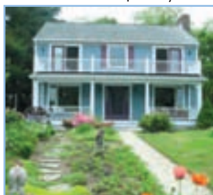
BEACH ACROSS STREET $699,900