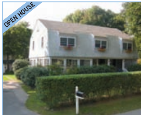
OPEN HOUSE 109 LONGFELLOW ROAD OPEN SATURDAY 11 - 1 Emily H. Craven Cottage in Shoreby Hill. Traditional architectural details with all the expected updates. Stone fireplace, hardwoods. $1,295,000