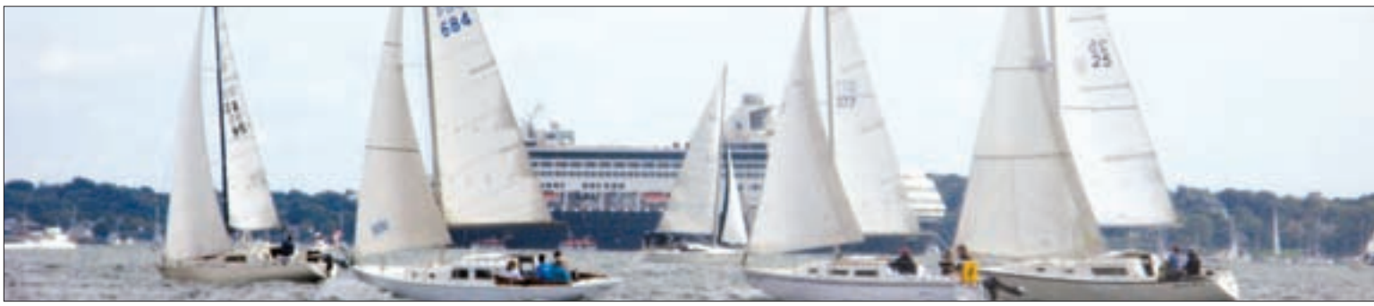
Now, that's a boat The Queen Mary 2, the world's largest cruise ship, called on Newport last week. It dwarfed countless pleasure boats in the bay.