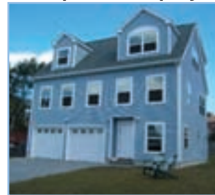
NEW WATERVIEW HOME ON HILL $524,999