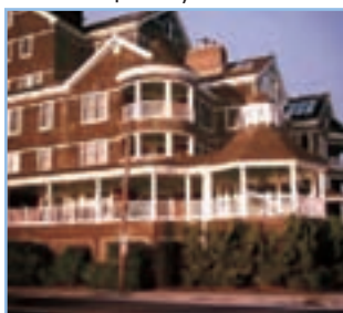
GREAT NEW INTERIOR! $699,900