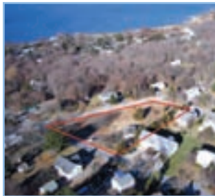
ORIGINAL COTTAGE NEARLY AN ACRE $399,000

For a complete list of all waterfront, waterview and homes near the water, please stop by, call or email.