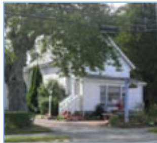
COMMERCIAL/ RESIDENTIAL POSSIBILITY $479,000