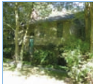
WEST FERRY COTTAGE $569,000