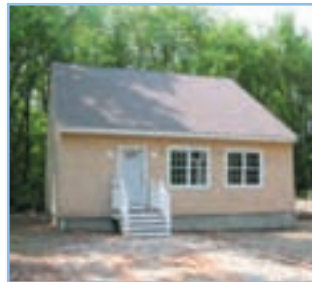
BRAND NEW CAPE ON DOUBLE LOT $419,900