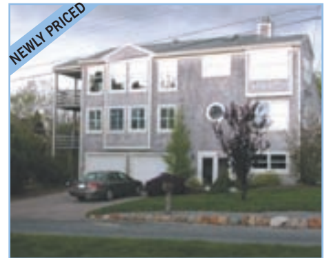
NEWLY PRICED BEAVERTAIL LOCATION WITH SEA VIEWS Large open living room with fireplace. Oversized kitchen. Spacious master suite. Two decks to enjoy the views. NEWLY PRICED: $789,900