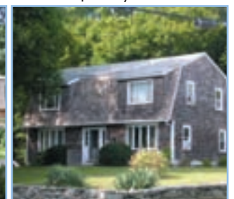
VILLAGE HOME WITH VIEWS TO HARBOR $925,000