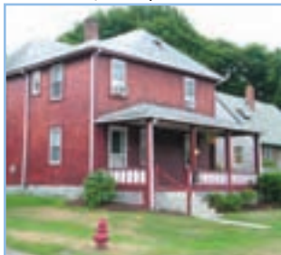
INTOWN HOUSE ON CORNER LOT $549,900