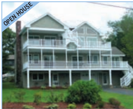
OPEN HOUSE 82 UMIK AVENUE OPEN SUNDAY 1 - 3 Fabulous Waterviews! Completely new interior. Three finished floors with decks and porches to enjoy this sublime location. Three bedrooms, 3 baths. $899,900