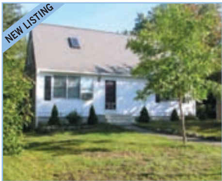
NEW LISTING SOUTH SHORES BRIGHT CAPE This traditional cape is on a double lot. Expansion is possible on the second floor. There is an above ground pool and a shed. $399,000

Please email 4 x 6 jpg photo to ginny@islandrealtyri.com . Please submit by October 30.