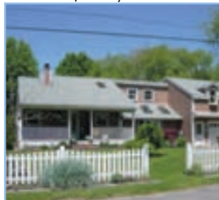
SPACIOUS HOME WITH LARGE MASTER SUITE $569,000