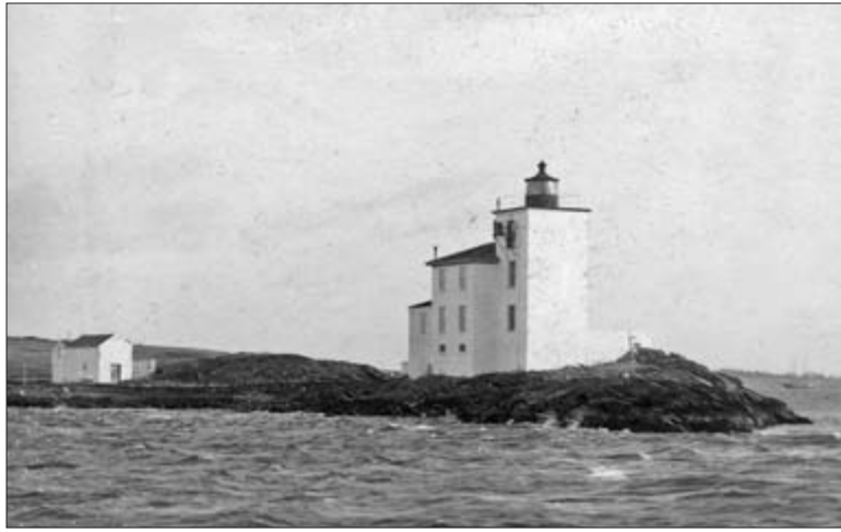
An early photo of the Dutch Island Light.