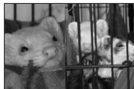
Rocky, Bullwinkle & Snowey

Prancer, Dancer and Vixen are 3 gerbils bred and born in Jamestown. They are 2 years old and are available because their owner is in college. They come with a great cage and are hysterical to watch. They are very cute; these boys are also friendly and easy to care for.