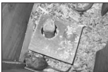
Prancer, Dancer & Vixen

Gweneth is a 6 year old, female, calico guinea pig. Her owner is allergic to her and needs to find a home for her. Gweneth is used to cats and dogs, but would prefer not to sleep in the same room with them, although daily interaction is acceptable. She comes with her own large cage and plenty of supplies.