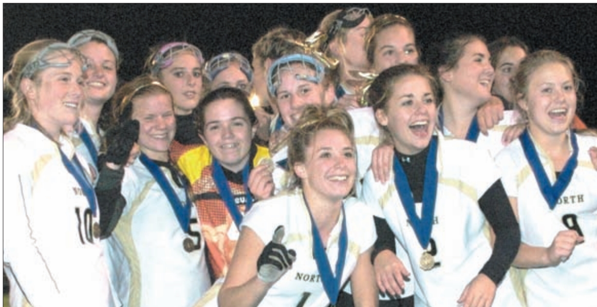
The North Kingstown High School field hockey team celebrates their win in the Rhode Island Division 1 state field hockey finals.

In June, the North Kingstown boys' outdoor track team beat Hendricken to win the state title. The Hawks held the title for nine years and did not give it up easily. The title came down to the 4 x 400 re-