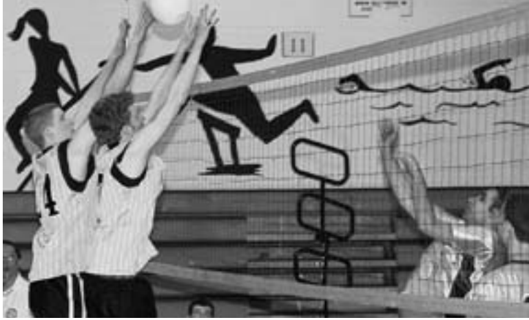
Skippers rise up in attempt to take a win from the Hendricken Hawks at last week's game.