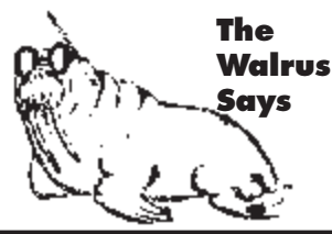
The Walrus Says