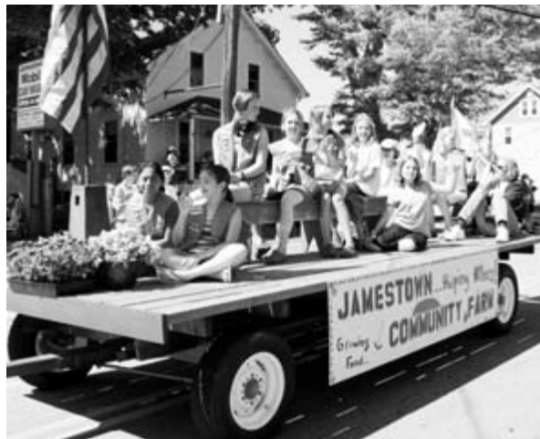
Jamestown Girl Scouts decorated a wagon for the Community Farm at the annual Memorial Day parade on Monday.