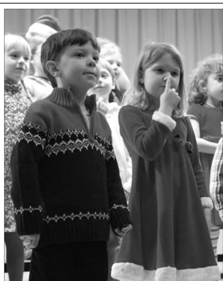
Christmas musical Kindergartners at Melrose School perform their annual Christmas play for family and friends, complete with sign language and dance movements.

For reasons that are beyond comprehension we all want to have the last word before we leave this system that we can't understand.