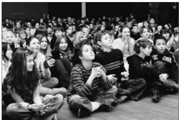
Students at the Lawn Avenue School on Tuesday were captivated as they watched the inauguration live.