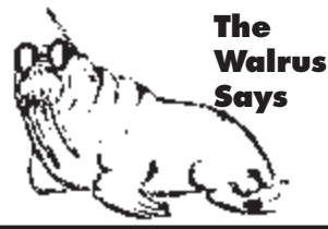
The Walrus Says