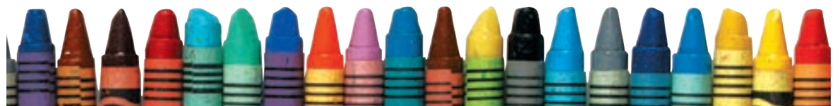
Anthony Zainyeh, Grade 6

From this experience, I learned that without your health, family, and friends, you are nothing. Another thing I learned is that, for example, if you are rushing to get to work every morning, relax sometimes, and eat breakfast with your family. My mom being diagnosed with breast cancer has changed everything. The way we eat, the way we live, and the way we act. If you think your problem is big, somebody else's problem is always bigger. Fighting breast cancer is like fighting a million battles, but the most important one, the battle with death.