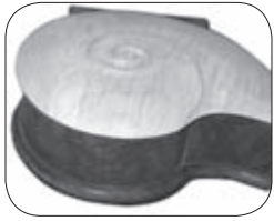
Nautilus shell is bubinga and curly maple