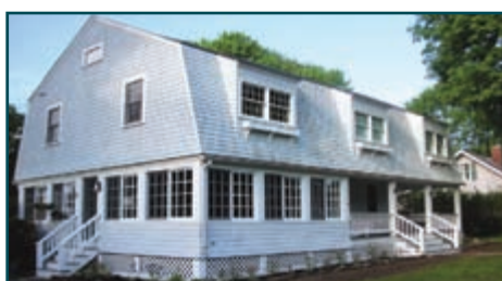
Wonderfully updated 3,374 sq. ft. home with 4-bedrooms and 3.5 baths on .29 acre.