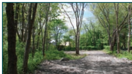
Ready to build lot on Maple Avenue close to Sheffield Cove. Maximum 2,100 sq. ft. home.