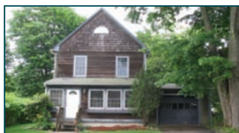
This 2,232 sq. ft. 3-4 bedroom home is on a 1/4 acre lot in the heart of the village.

OPEN HOUSE SUNDAY, 1 P.M. - 3 P.M. 63 HOWLAND AVENUE $499,000