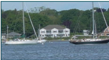
Gorgeous water views from chic, stylish 2-bedroom, 2-bath unit directly across from the water.

OPEN HOUSE FRIDAY, 2 P.M. - 4 P.M. 73 CONANICUS AVENUE $724,900