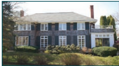
Charming 2,474 sq. ft. 5-bedroom home on .80 acres in quiet Shoreby location.

OPEN HOUSE SATURDAY, 1 P.M. - 3 P.M. 65 WHITTIER $1,295,000