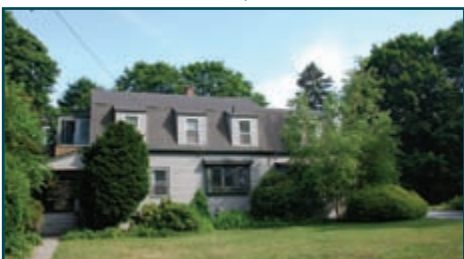
Classic 2,500 sq. ft., 5-bedroom cottage on a lovely 24,394 sq. ft. lot.