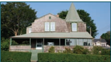
Stunning harbor views from 3,185 sq. ft. home across the street from the Bay.

OPEN HOUSE SUNDAY, 1 P.M. - 3 P.M. 2 WALCOTT AVENUE $1,350,000