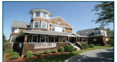
Distinctive 5,000 sq. ft. shingle-style home on an acre with deeded beach rights.

OPEN HOUSE SUNDAY, 11 A.M. - 1 P.M. 95 WESTWIND $1,399,000