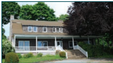
Panoramic water views are enjoyed from this 5-6 bedroom, shingle-style 4,900 sq. ft. home.

OPEN HOUSE SUNDAY, 1 P.M. - 3 P.M. 9 CONANICUS AVENUE $2,450,000