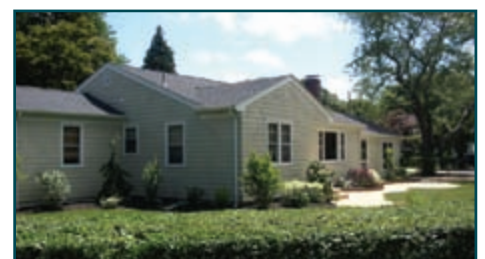
Stylish 2,068 sq. ft. 3-bedroom home blends contemporary features with cottage charm.