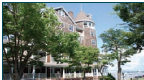
1,420 sq. ft. 2-bedroom, 2-bath unit across from the Marina, with water views from the deck.