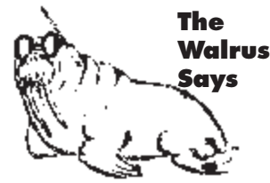
The Walrus Says